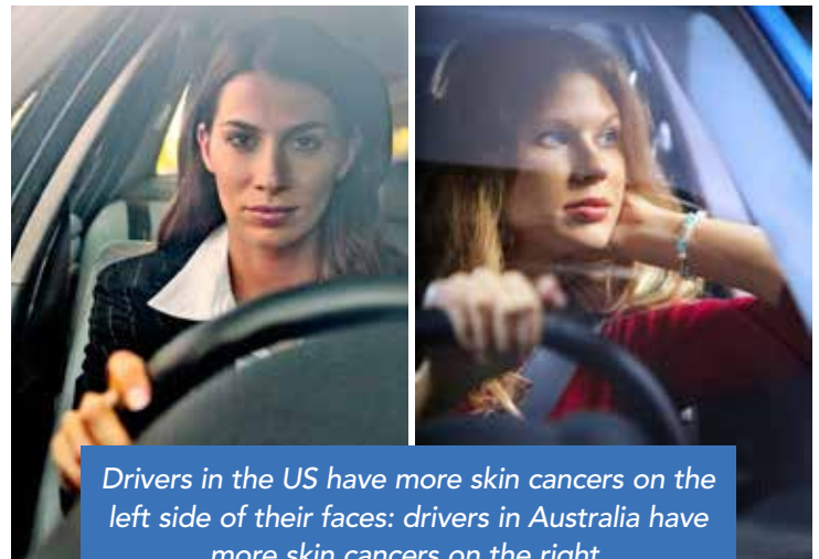
Drivers in the US have more skin cancers on the left side of their faces: drivers in Australia have more skin cancers on the right.

Fortunately, UVA-filtering window film can go a long way to prevent skin damage. Combining UVA absorbers in varying strengths, the transparent films are available from clear to dark tints for vehicles' side and back windows in all 50 states; it screens out more than 99 percent of UVA and UVB without reducing visibility.